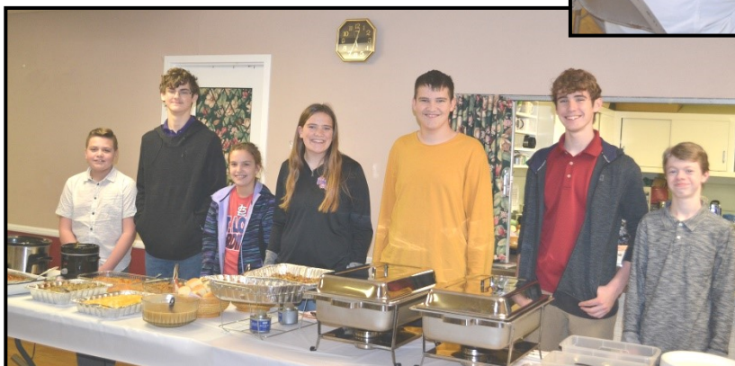
The youth helped serve the dinner