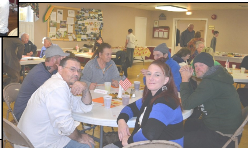
Some of our guests