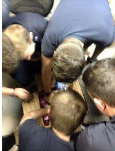
Sailors dive into care packages

I'm sitting here somewhere off the coast of who knows where writing you this with the biggest smile on my face because of what all of you have done for me, my friends in Reactor Electrical, Reactor Training, and Reactor Auxiliaries divisions! Last week I received a phone call while on watch that roughly 250+ pounds of mail arrived on the ship for me. After getting several guys to help me carry it to my berthing where I live, I opened it up and was surprised to see 1 gallon care baggies in all of them. It was awesome! There was soap, toothpaste, candy, cards, puzzles, magazines, snacks, drink mix, granola bars, and toilet paper. With us nearing the end of our deployment, the ship's store is not stocked with the essentials that we need, so these care packages were a life line! Thank you to all of you who donated items or money in order to make this happen. Over 200 sailors aboard the USS George Washington received items. Many, if not all, who received a bag shared it with someone else ensuring that more people were able to benefit from these care packages.