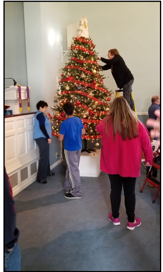
We hope the church's Insurance is paid up.