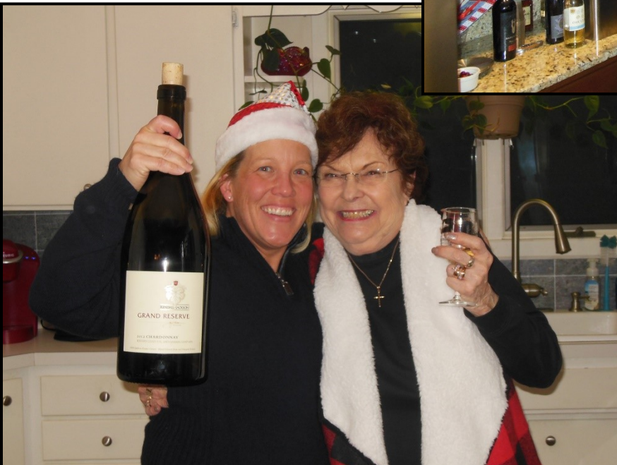
Two ladies enjoying the wine