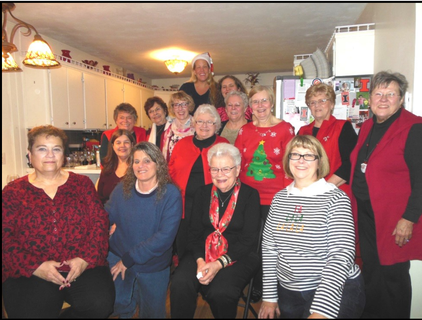
The ladies of the dinner