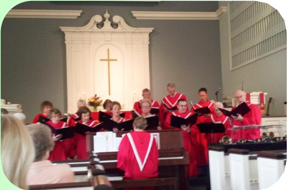
The Vocal Choir