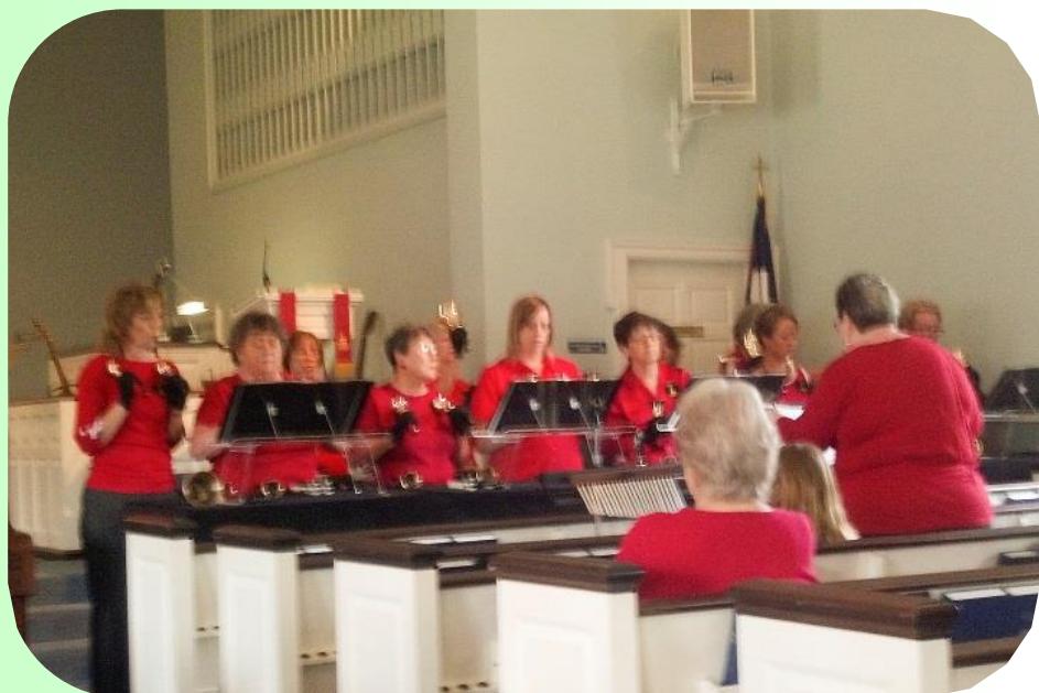
The Handbell Choir