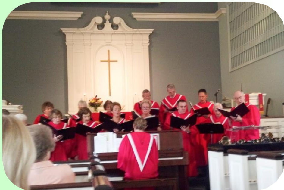
The Vocal Choir