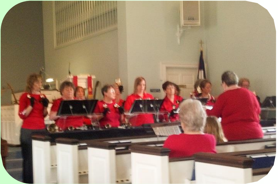
The Handbell Choir