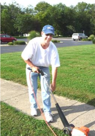
Workers at Last September's Work Day