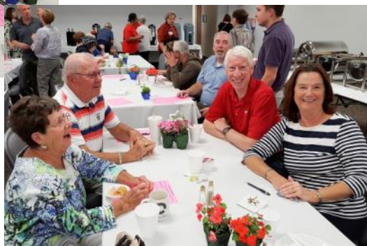
Church members at the Volunteer Appreciation Breakfast Buffet