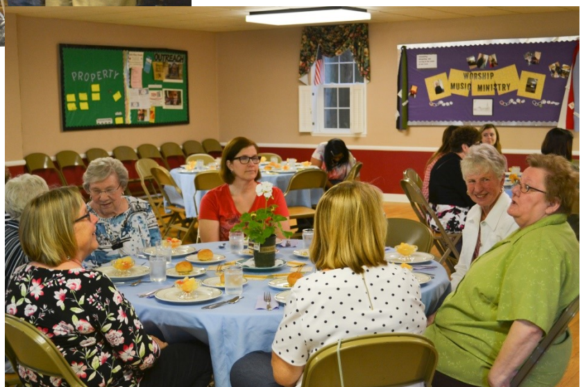
Ladies waiting to start eating