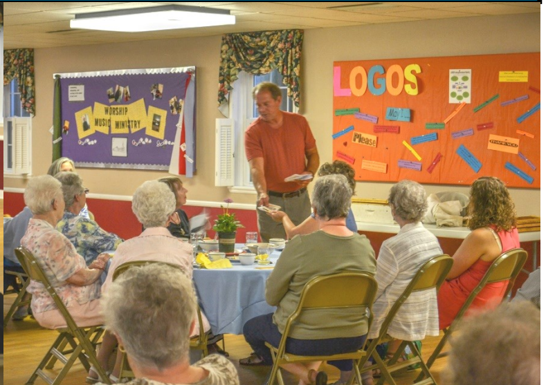
Our speaker talking about raising Bees