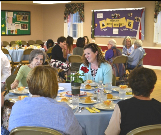
Everyone having a good time