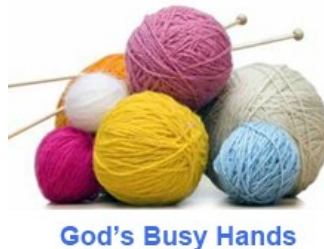
God's Busy Hands