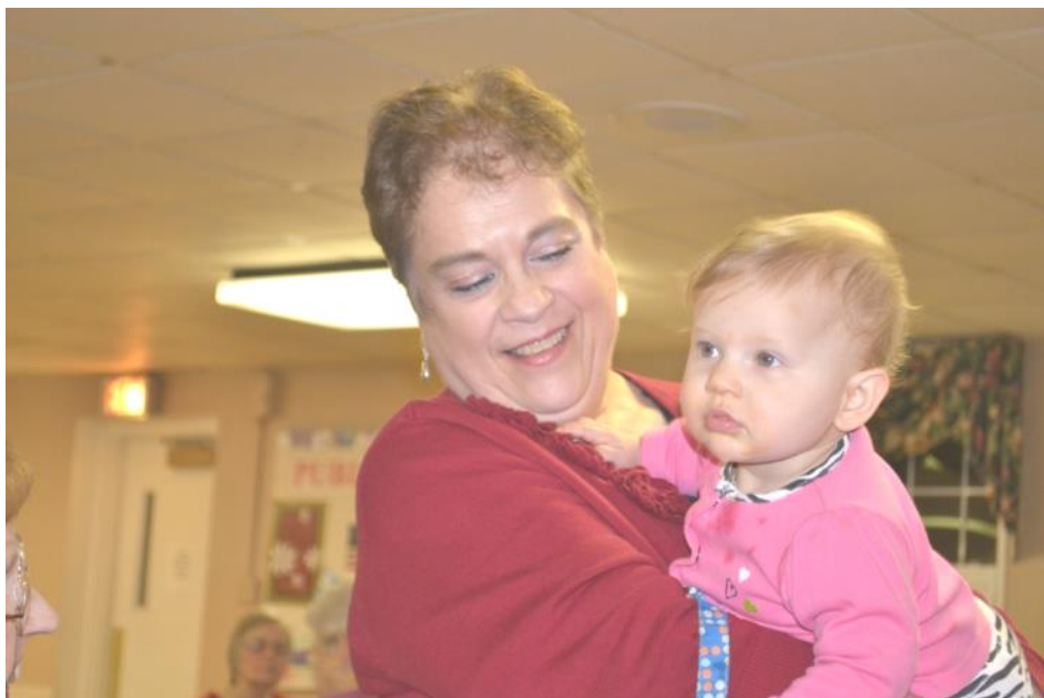
Our Vice President and her “sweetheart”