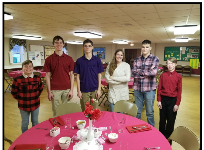
The Working Youth Group