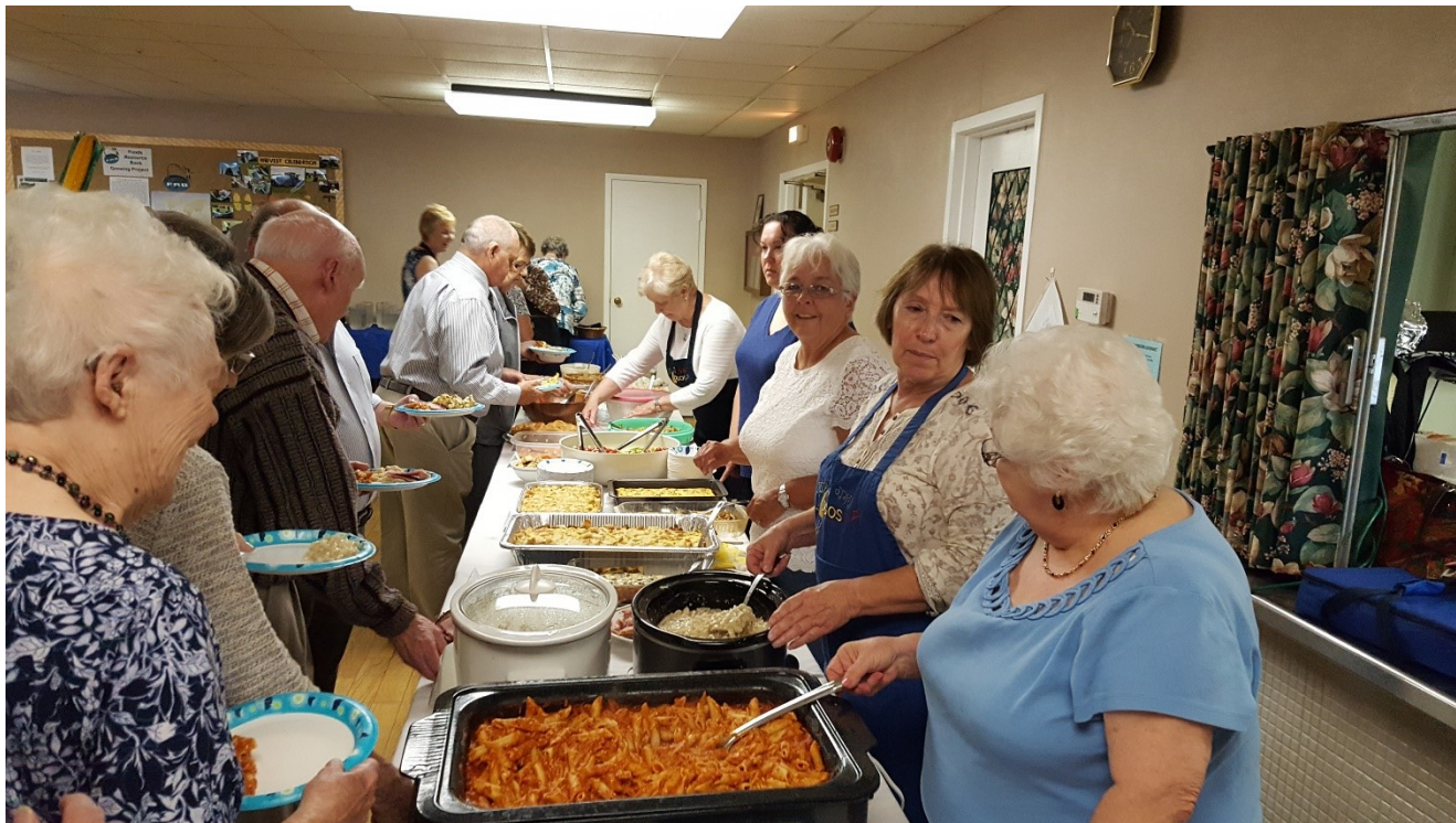
LOGOS women serving lunch for our Thanksgiving Sunday