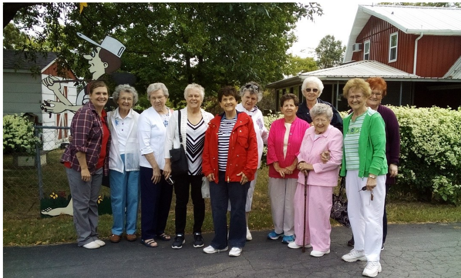
Women's Fellowship Group Visiting Okaw Valley Apple Orchard