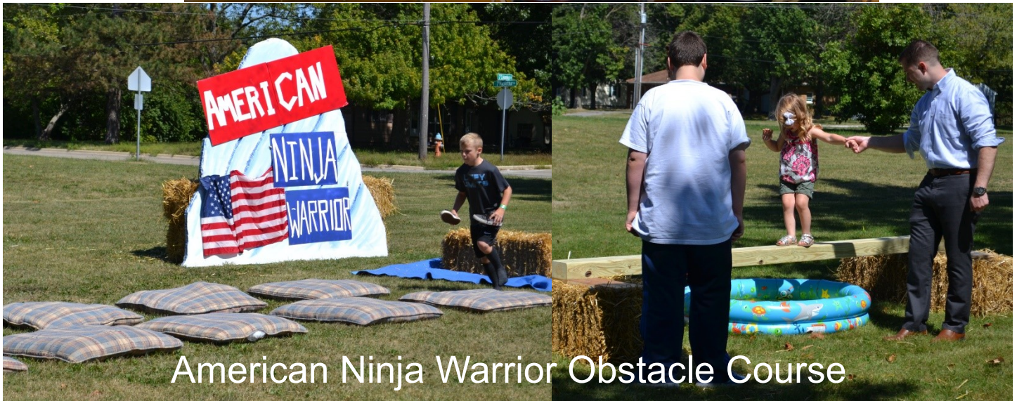
American Ninja Warrior Obstacle Course