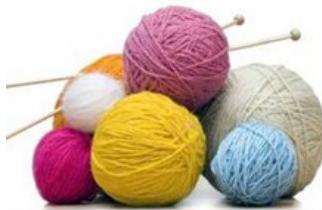
God's Busy Hands