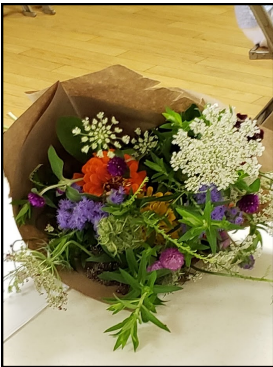
A bouquet like we each received